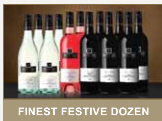
FINEST FESTIVE DOZEN