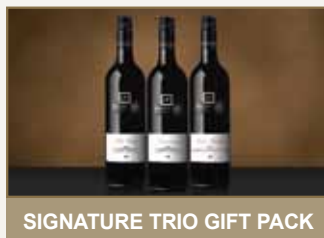
SIGNATURE TRIO GIFT PACK

Sound tempting? Jump online ( www.brownhillestate.com.au ) to purchase or give us a call on 1800 185 044.