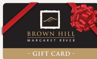
- GIFT CARD -